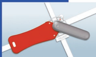
Unisto manual tool